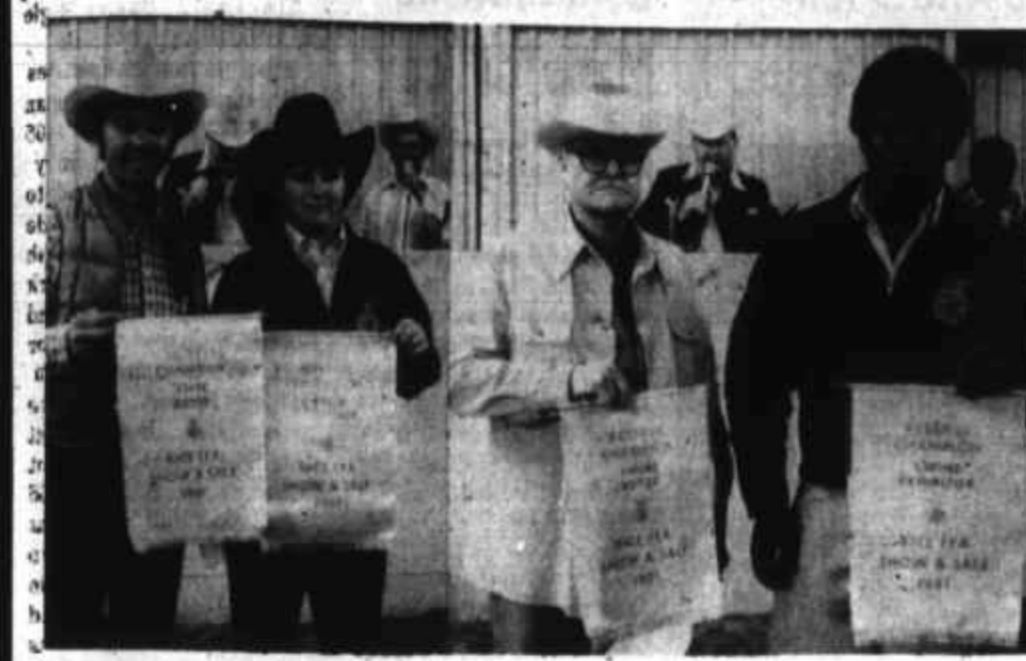
Buyers of the reserve champions in the call and hog divisions of the Rice FFA Show and Sale held last Saturday are shown above with the owners of the entries.