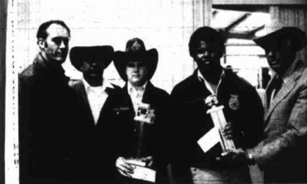
Reserve champion award winners in the Rice FFA Show and Sale held last Saturday are shown receiving checks and trophies.